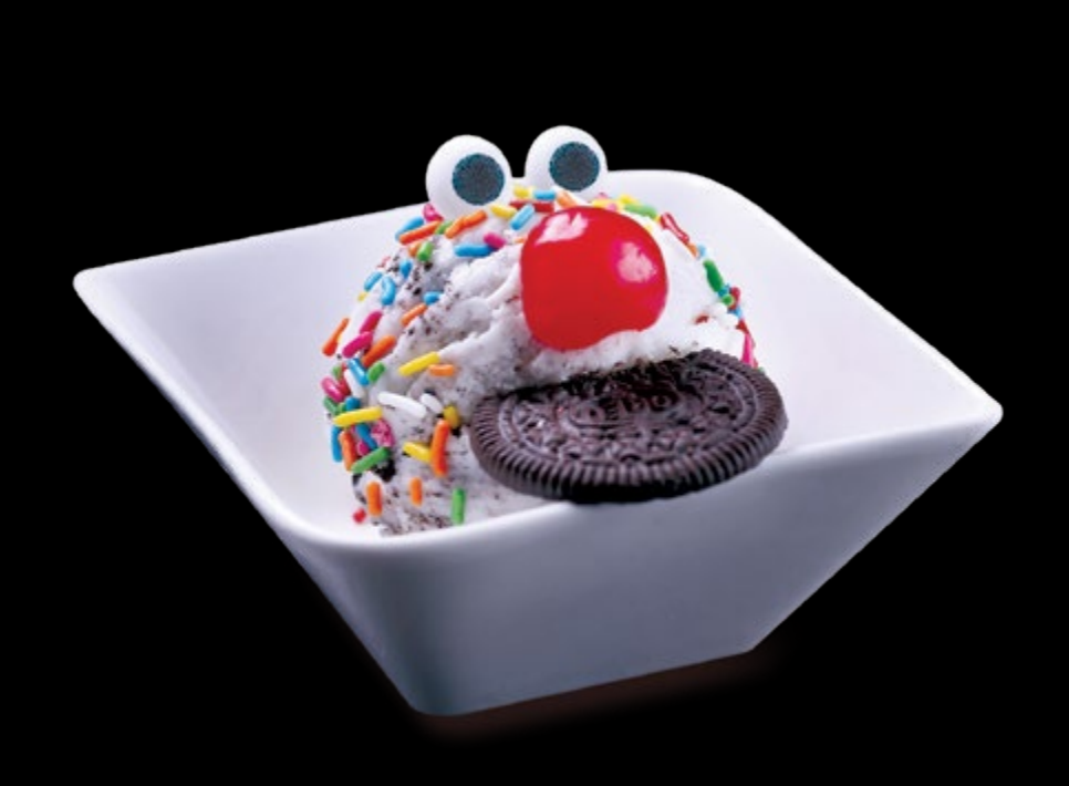
Cheese Monster Cheese Cookies ice cream sundae