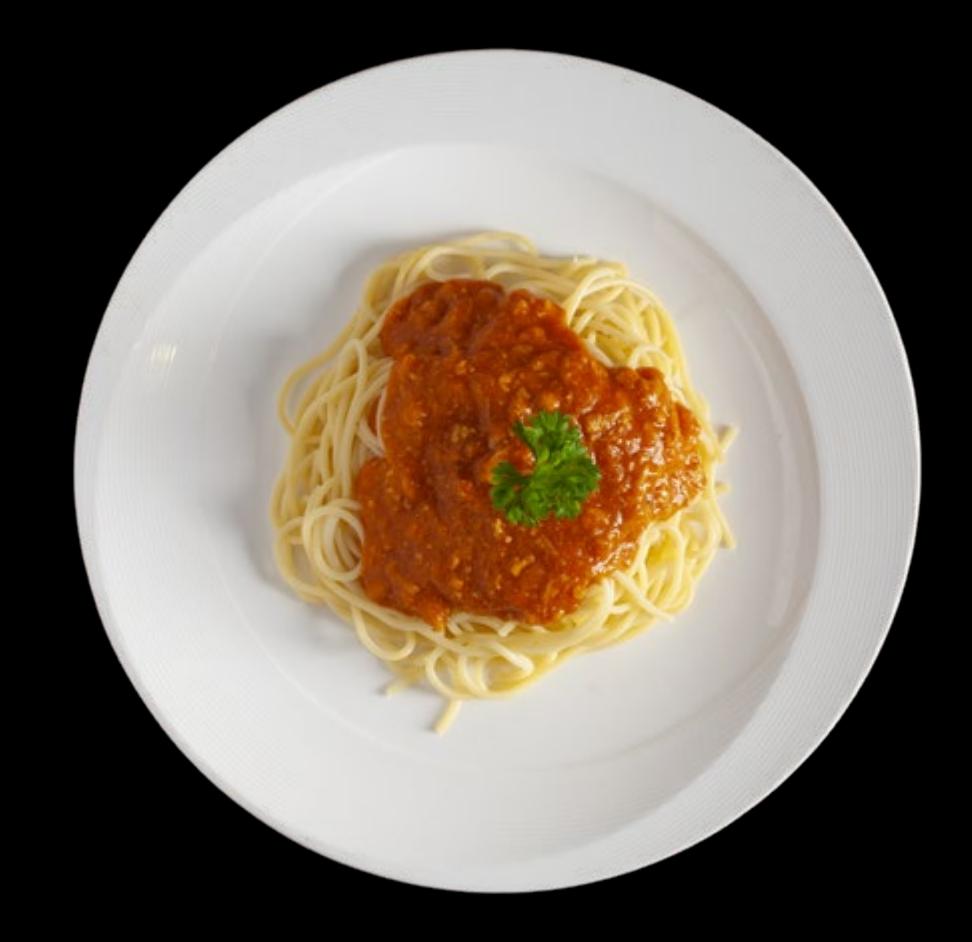
Spaghetti Twirlies Spaghetti and chicken bolognese sauce