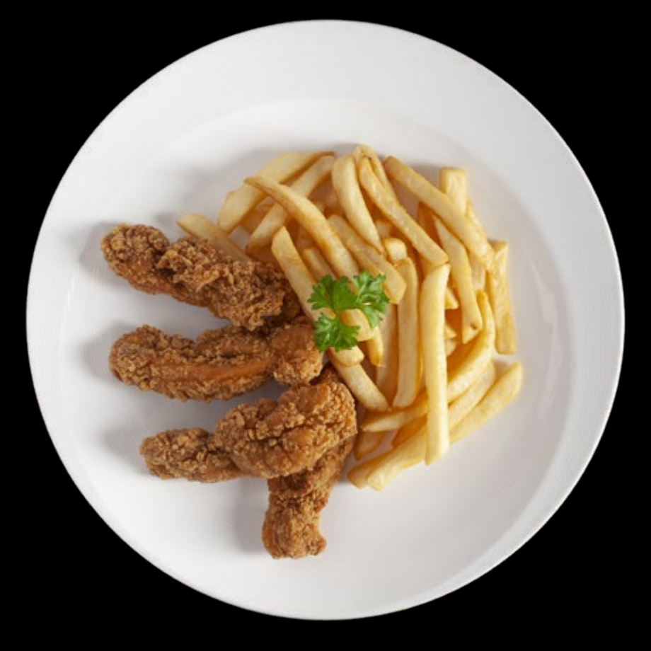
Chick 'N' Fries Breaded chicken strips and U.S. fries