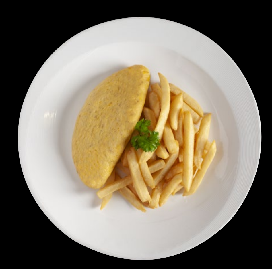
Cheesy Omelette Omelette and U.S. fries