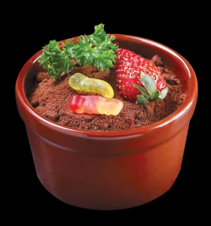
Garden Pot Chocolate sundae