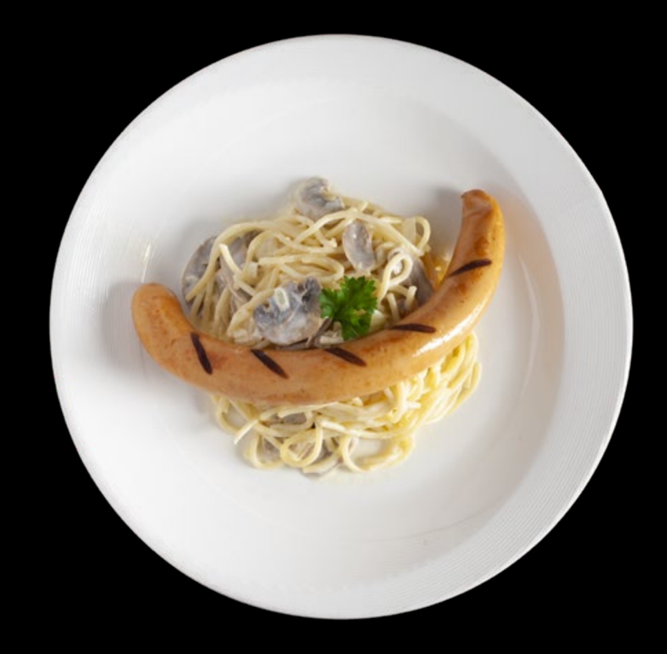
Creamy Mushroom Spaghetti Spaghetti in mushroom, cream and cheesy chicken sausage