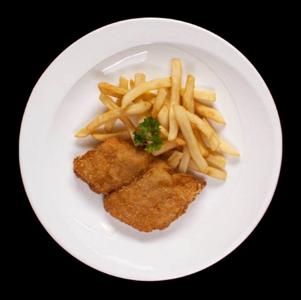
Fish 'N' Chippies Fish fillet and U.S. fries