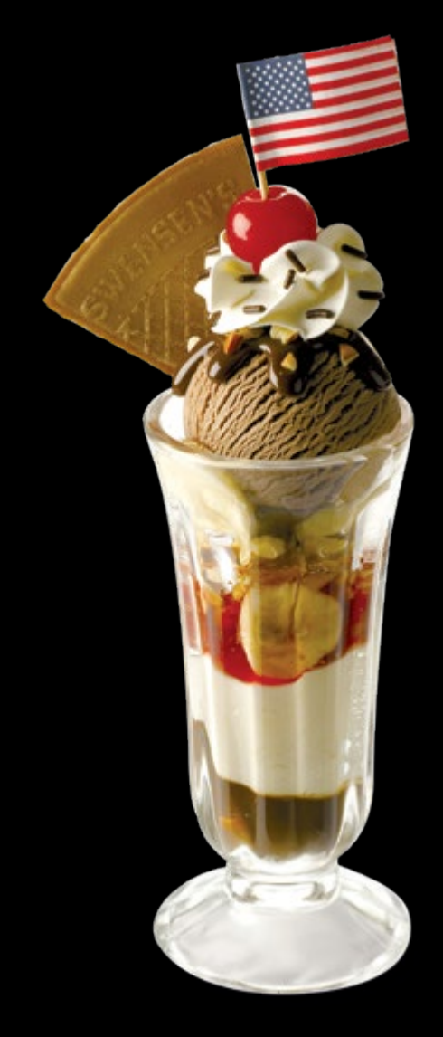
Coit Tower Junior Chocolate and vanilla sundae