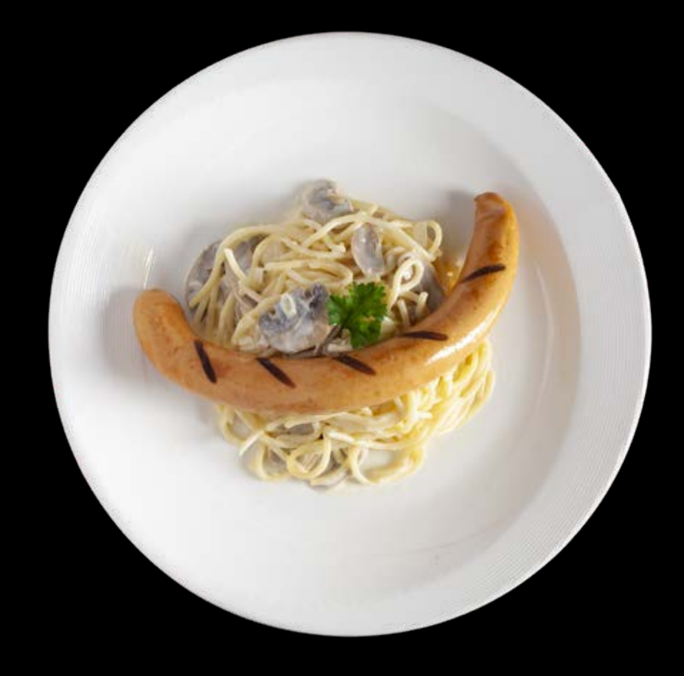
Creamy Mushroom Spaghetti Spaghetti in mushroom, cream and cheesy chicken sausage