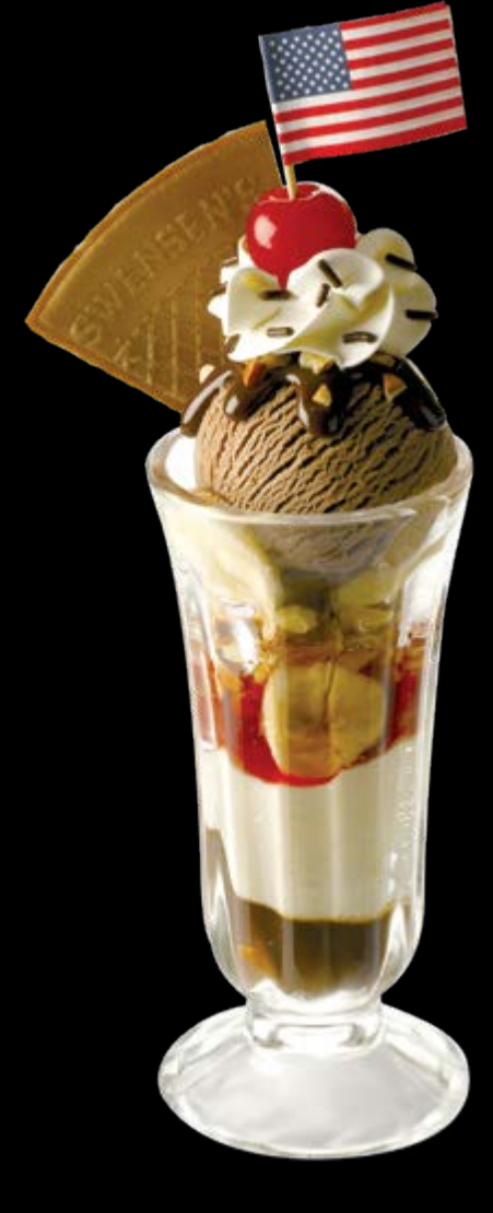
Coit Tower Junior Chocolate and vanilla sundae