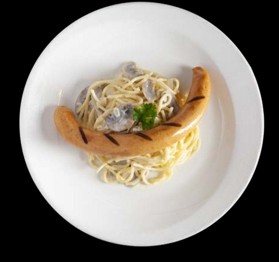
Creamy Mushroom Spaghetti