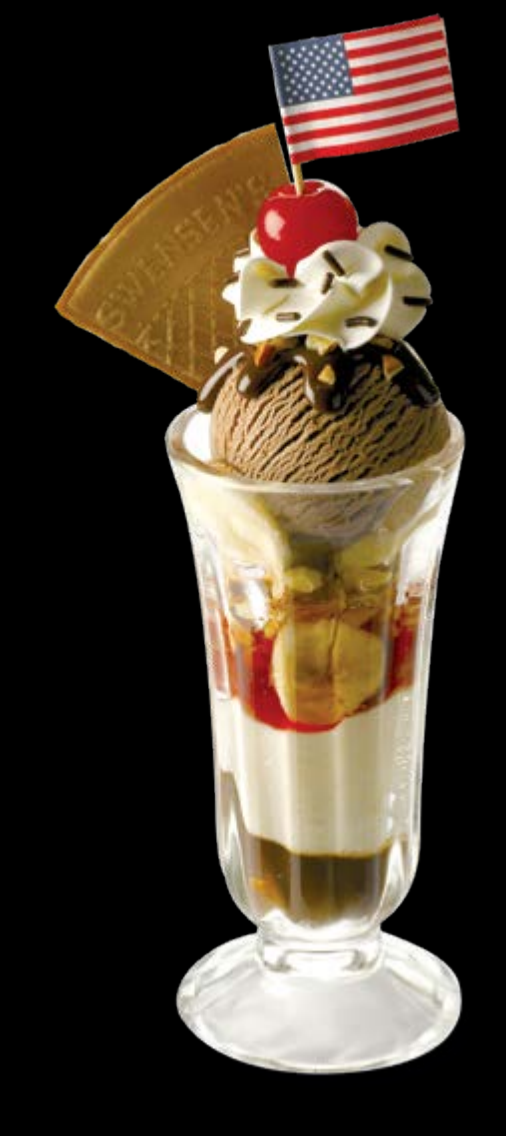
Coit Tower Junior Chocolate and vanilla sundae