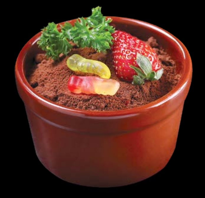
Garden Pot Chocolate sundae