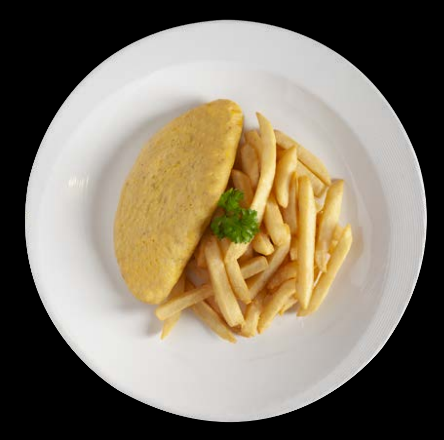
Cheesy Omelette Omelette and U.S. fries