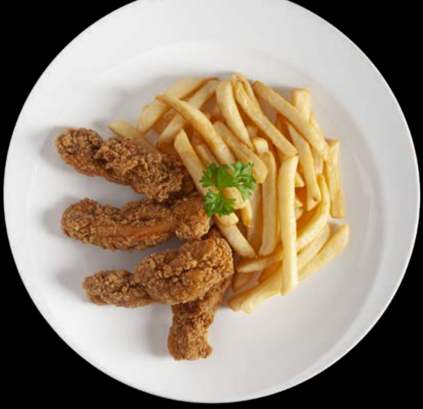
Chick 'N' Fries Breaded chicken strips and U.S. fries